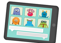
Virtual or F2F banquets