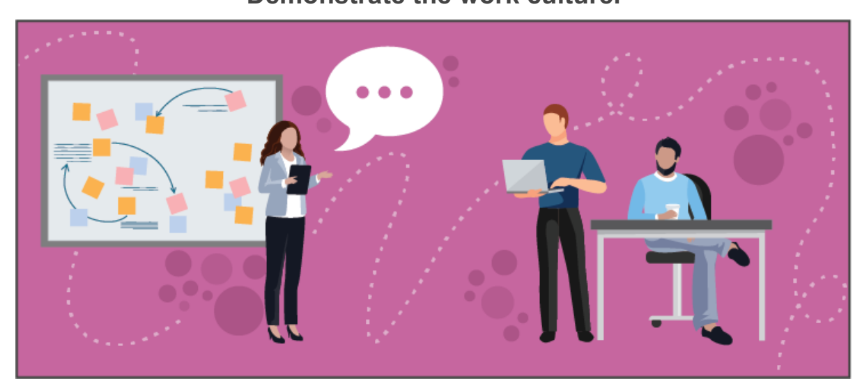
Lead an honorable life.