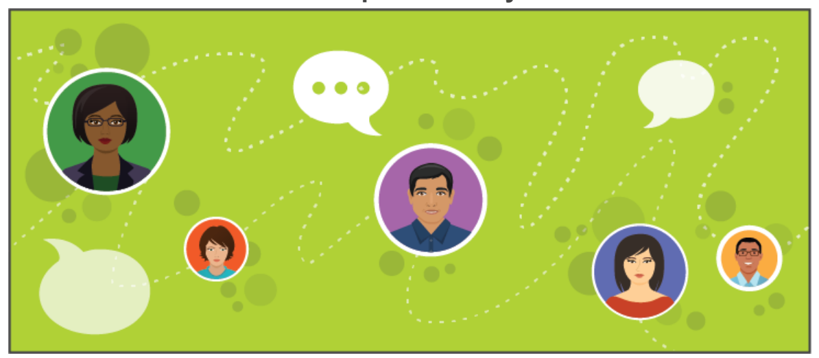
Be honest and trustworthy.